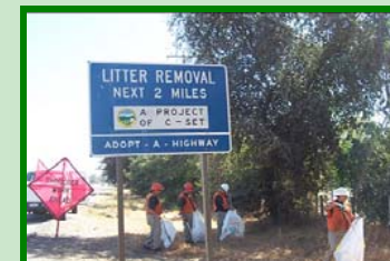
Corpsmembers hard at work keeping our 2-mile stretch on Hwy 198 litter free