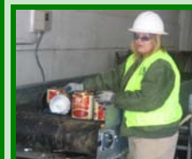
Corpsmember sorting through collected materials at the Recycling Center