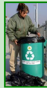
Preparing recycling containers for schools and special events