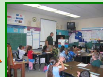
Recycling Specialist conducting a 4R's presentation