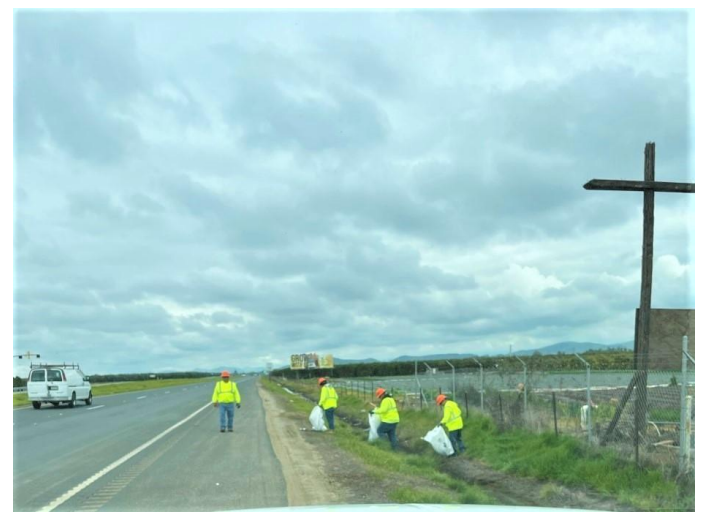
The Sequoia Community Corps crew working along State Route 65