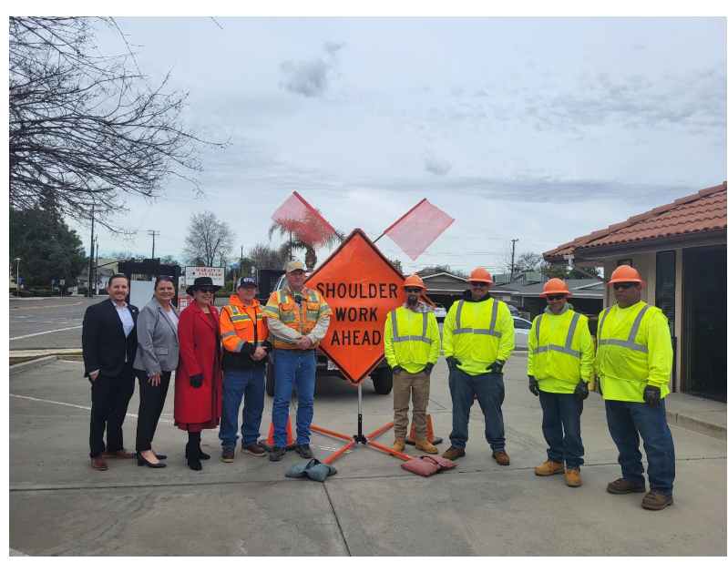
CSET hosted The City of Porterville and Caltrans to kick-off the partnership

To learn more about CSET's Sequoia Community Corps you may call (559) 732-4194, or visit: <u>https://www.cset.org/sequoia-community-corps</u>.