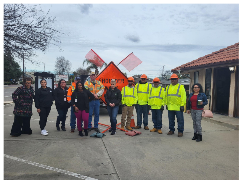
CSET, Caltrans, Sequoia Community Corps, and The Porterville Welcome Center staff